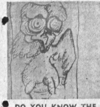
DO YOU KNOW THE CHICKEN PLUCKERS?

Thats it for this week — Remember to get and use Easter Seals. . . .