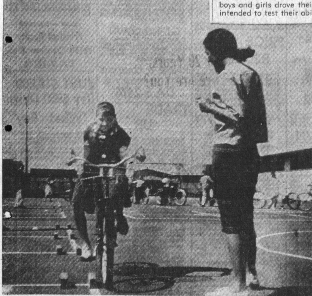
TRAIGHT LINE DRIVING is also aimed at determining how well the student steers. Purpose of rodeo is to supplement classroom instruction on "do's and don'ts" of bicycle safety. Preceding event, teachers conduct dis-