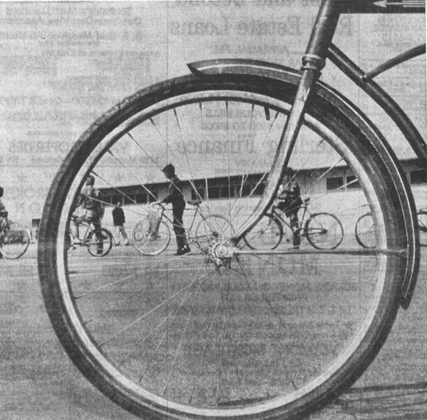
BICYCLE SAFETY was given emphasis at Sepulveda Elementary School recently when students participated in the school's second bicycle rodeo. One hundred sitxy boys and girls drove their bikes around a skills course in a narrow lane. intended to test their ability at handling their bicycles.