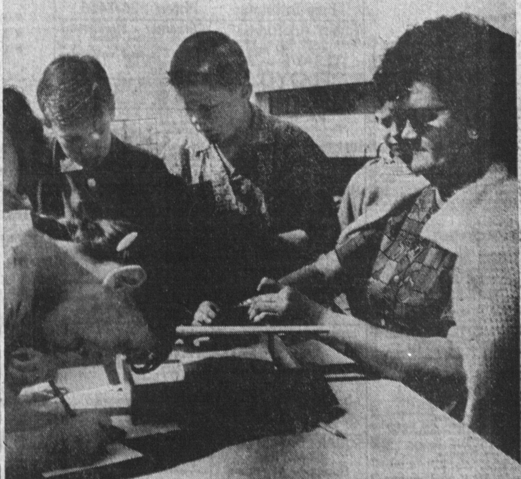
STUDENTS REGISTER for bicycle rodeo performance test prior to testing