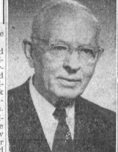
JOSEPH F. SMITH