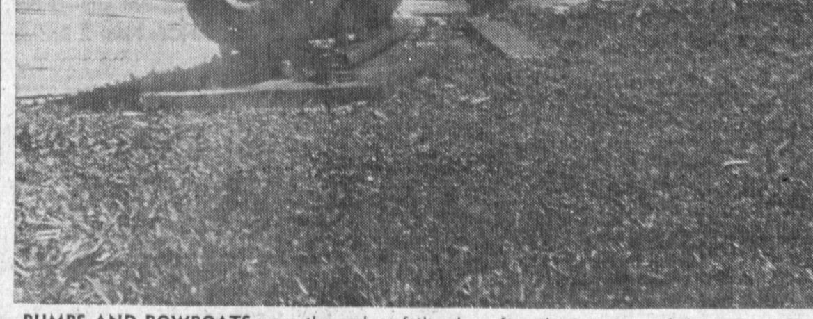
PUMPS AND ROWBOATS were the order of the day after the torrential rains on W. 238th St., west of Western Ave., near the Silver Skates restaurant, Men from the Torrance Street Department man-

Based on the April 1, 1960 census, Torrance and the bler dealerships for six what younger than Los Angeles County as a whole. The median age of residents sified ads for quick results. 31.3 for the county, and 30 for the state.