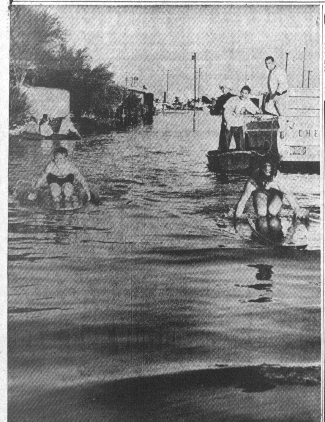
SURF BOARDS, BOATS and rubber dinghies were used in this flooded area of Torrance, on W. 238th St., at Huber Ave., to get in and out. The par-