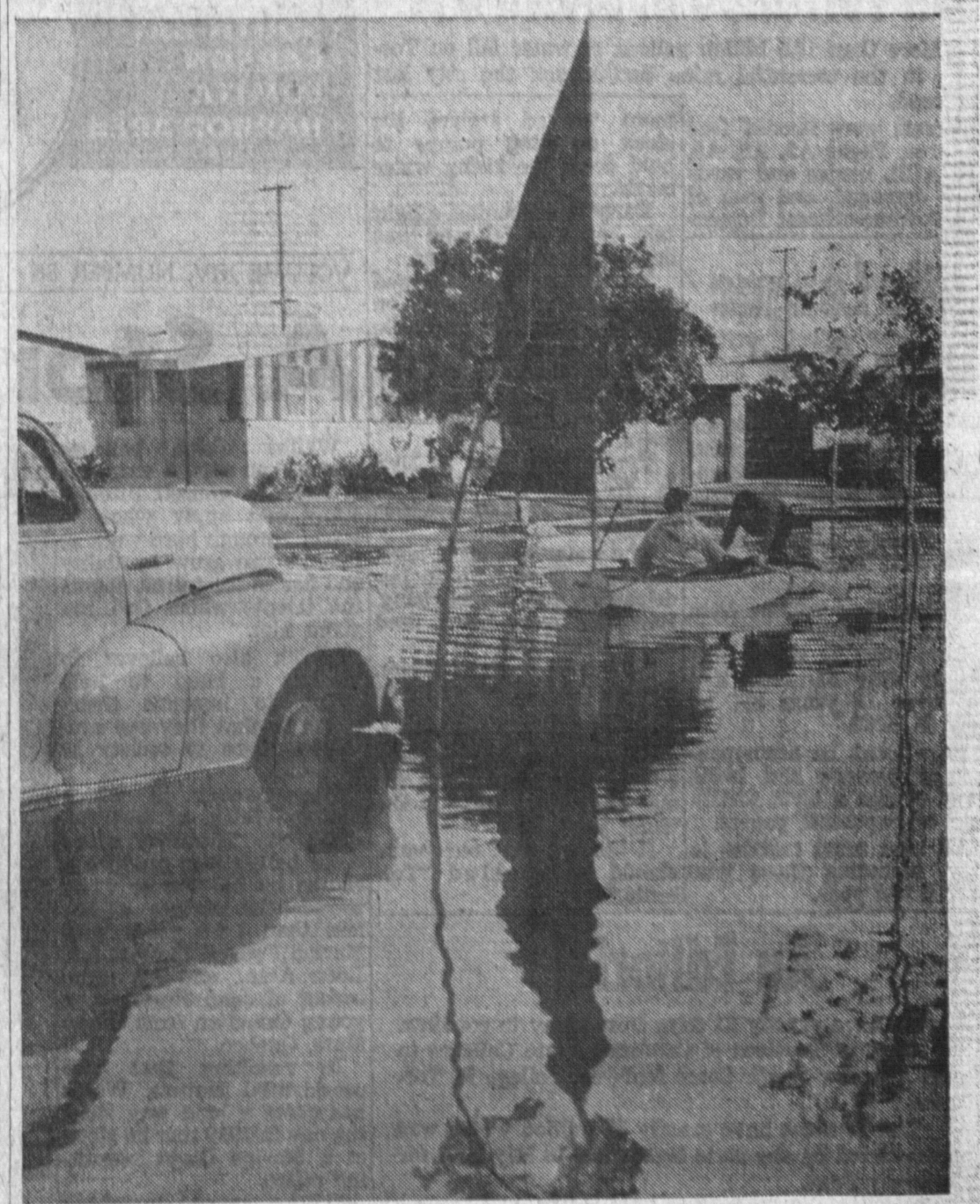
THERE THEY GO post the car stalled in the water. Pumps of the Torrance Street Department were kept going night and day as men worked around the clock to hold the level of the flood-