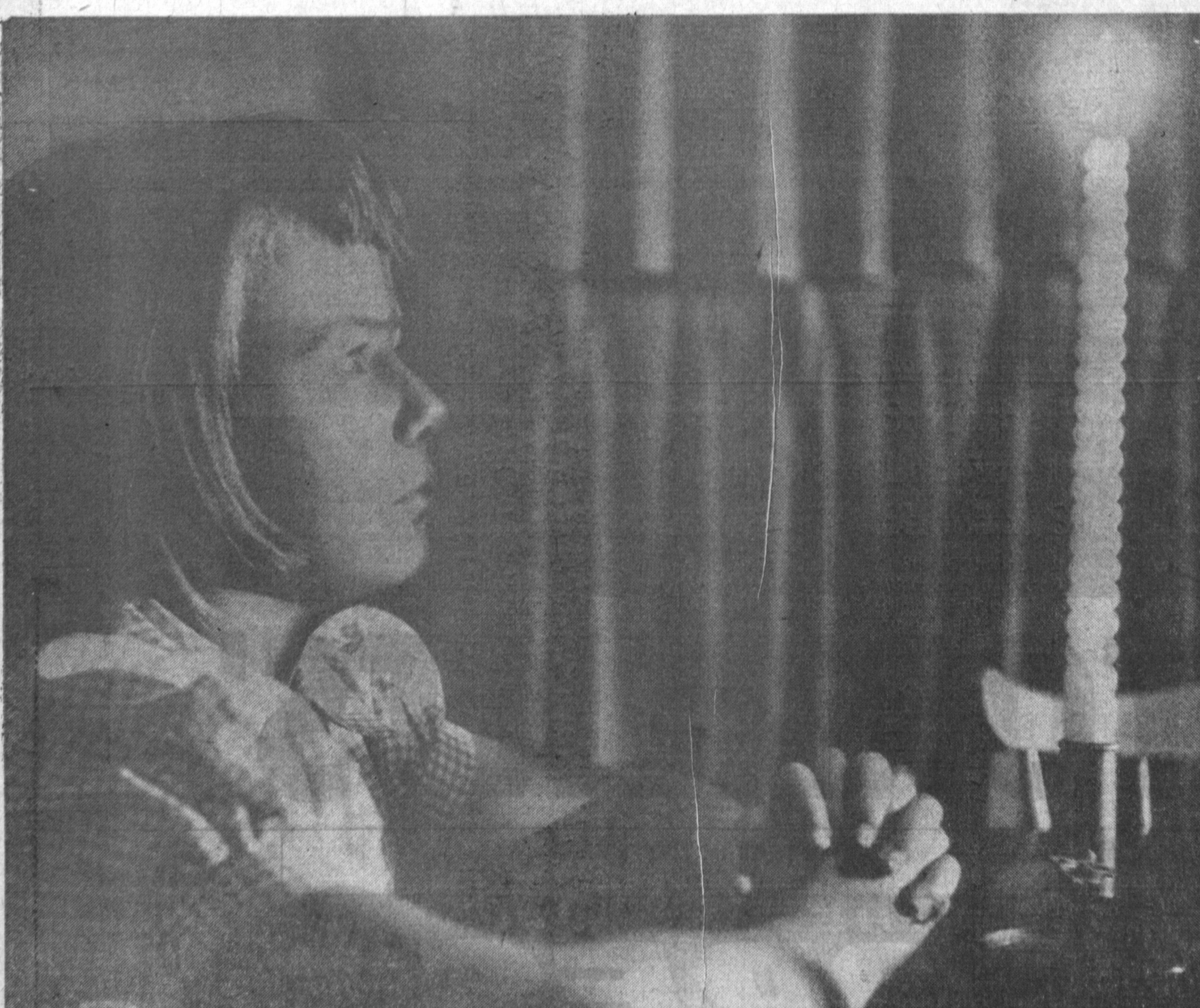
THE WONDER OF LIGHT to a child is a wonder to behold. What makes the candle burn? Where does the light go when it goes out?