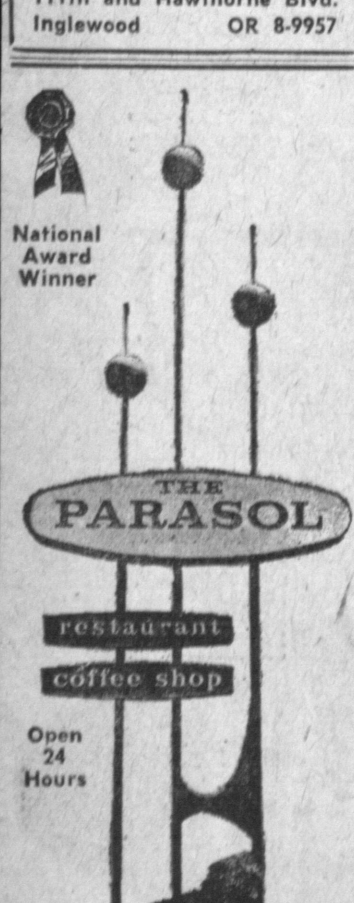
PACIFIC COAST HIGHWAY AT CRENSHAW DA 8-4220