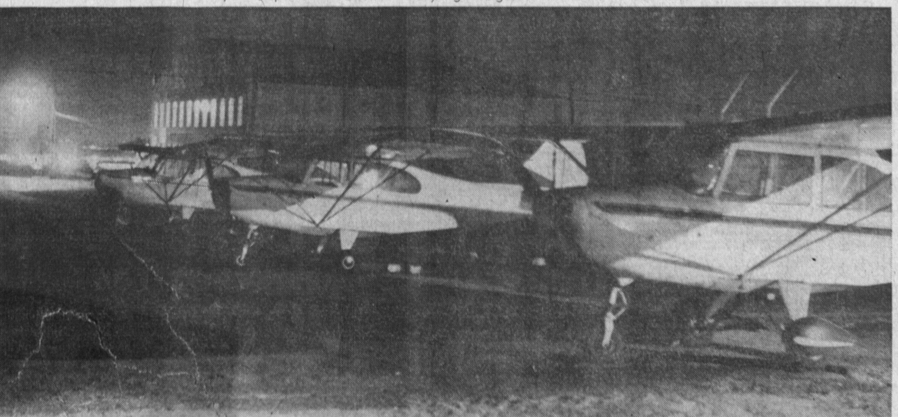
LINED UP and waiting for another flight are planes owned by peoplie the airport has one runway 5000 feet long, but plans are being made ing to protect planes from thieves and vandals, as well as assisting handled by the facility. pilots using Torrance airport for the first time. At the present time

ings. Torrance airport on one busy weekend logged 170 take offs and