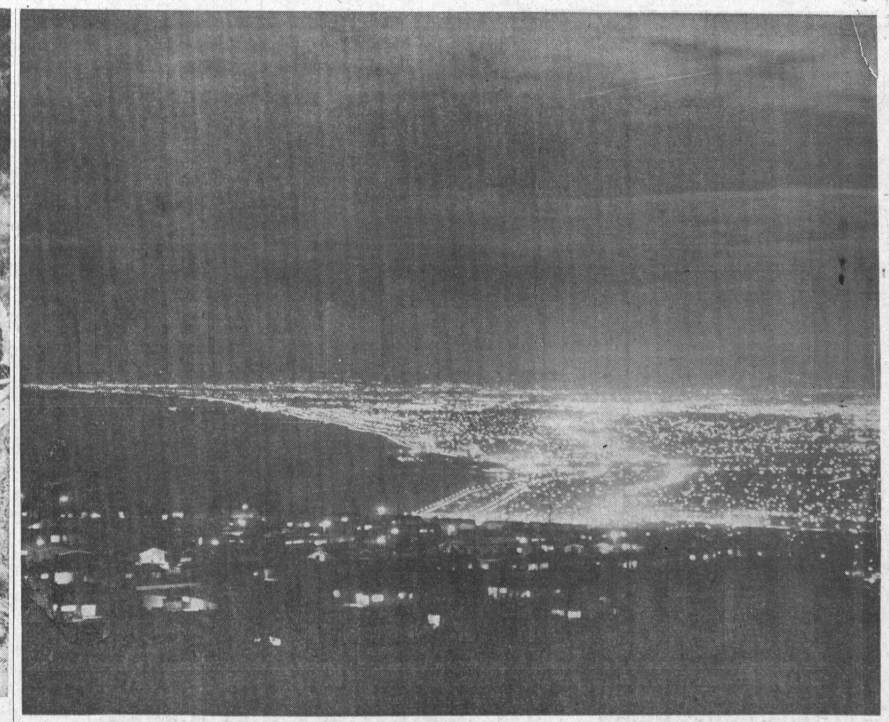
LOOKING NORTH along the coast line from the Palos Verdes Hills at night gives the illusion of fairyland stretched as far as the eye can see. Lights and shadows hide the homes, the businesses and