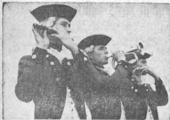
COLONIAL HARMONY —Members of Old Guard Fife and Drum Corps rehearse music they played in the Army pageant "Prelude to Taps" during the National Cherry Blossom Festival in Washington, D. C. Some selections dated back to the days of George Washington's Army.