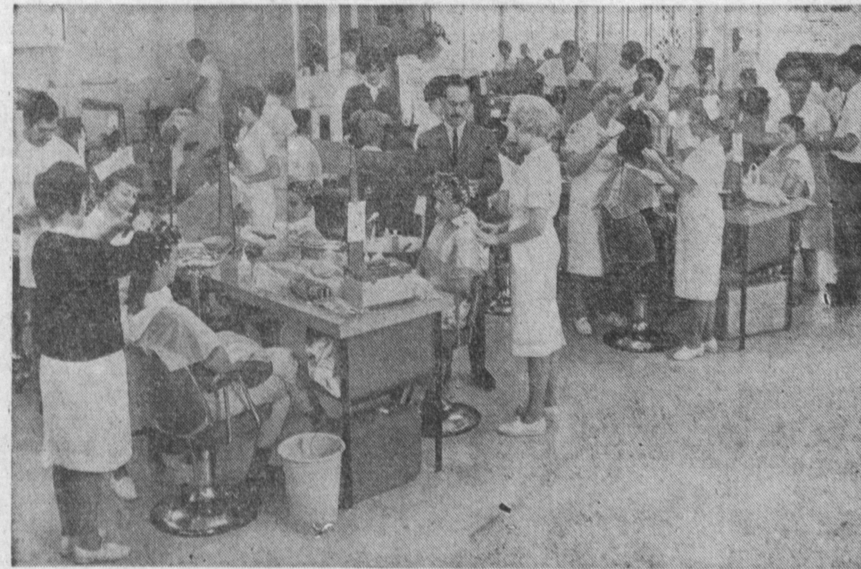
SALON TRAINING: Practical salon training qualifies you to work in any fine beauty salon or perhaps hold a top position in the many allied fields of Cosmetology. You may want to specialize as a makeup artist, cosmetic consultant, manufacturer's representative, salon manager, hairstylist, tinting or facial specialist or any of many other highly paid positions available. Through the training you receive at Flavio Beauty Colleges you may enter an ever-expanding number of fields allied to the industry.

$46 Down Payment—Includes books and equipment—Small Weekly payments to fit your budget. Advance hair styling and hair cutting classes held periodically..for licensed cosmetologists. Please call for information.