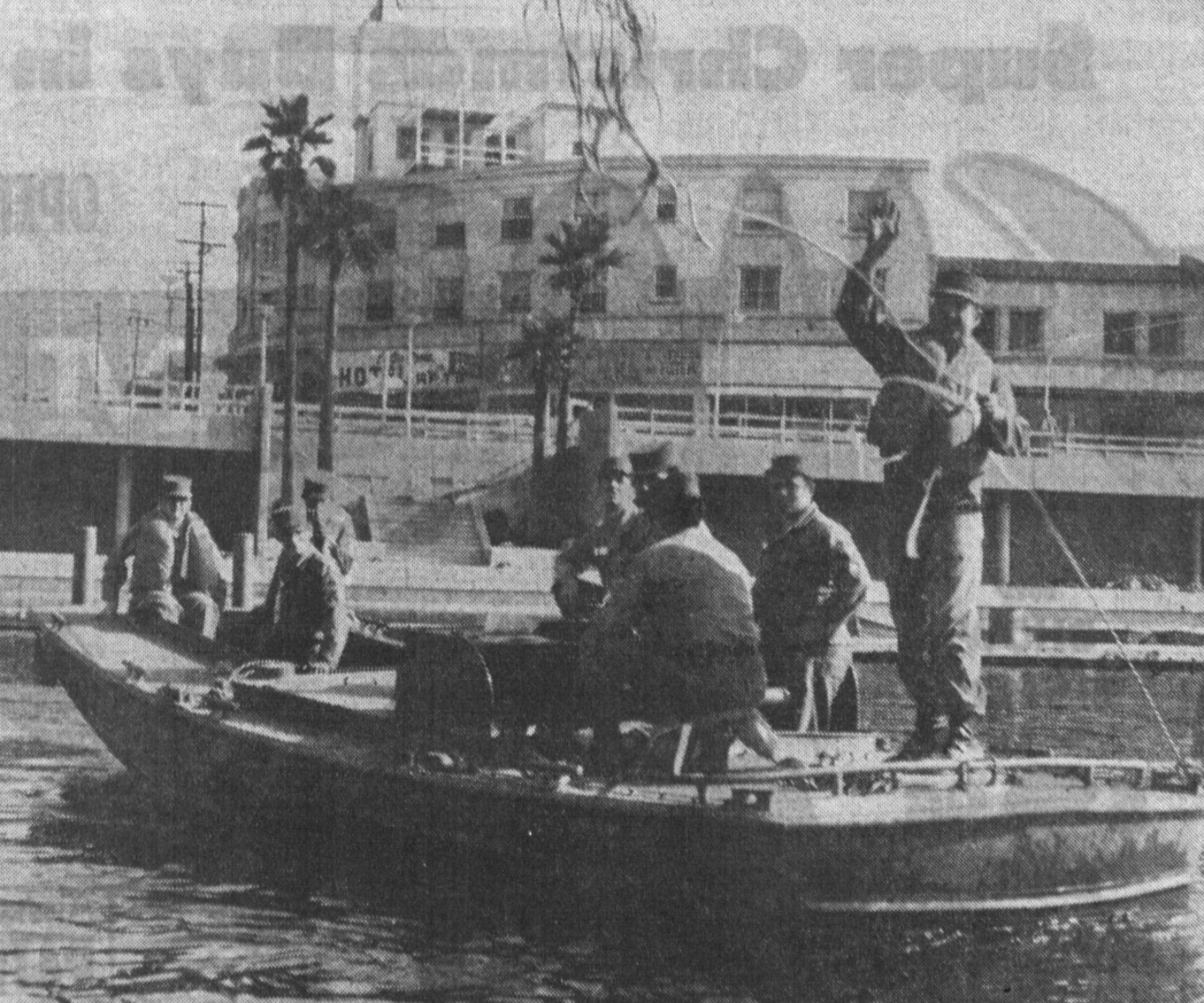
FINALLY OFF on landing maneuvers, Guardsmen made Guardsmen received training instruction by First Lt. two runs in Redondo Beach King Harbor before label-ing training program a success. On landing mission,