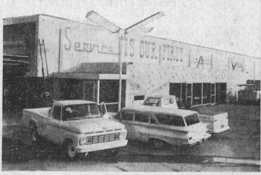
WELCOME TO VEL'S FORD-MOST SALES AND SERVICE CENTER