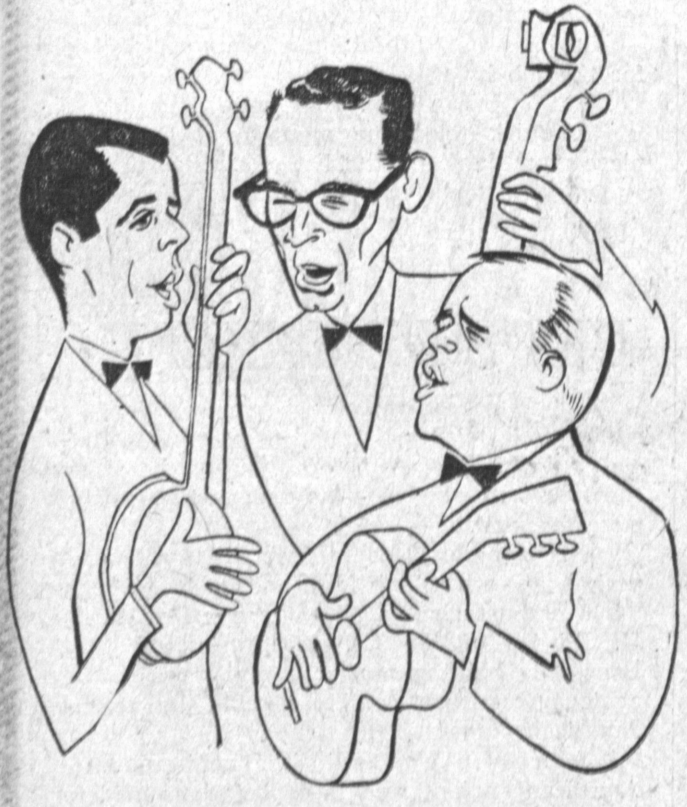
THE LIMELITERS , who wind up their 1962 concert season with a final show at Santa Monica Civic Auditorium, Dec. 14th. Concerts, Inc. is presenting the attraction.