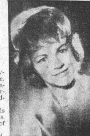
. . . to wed in January