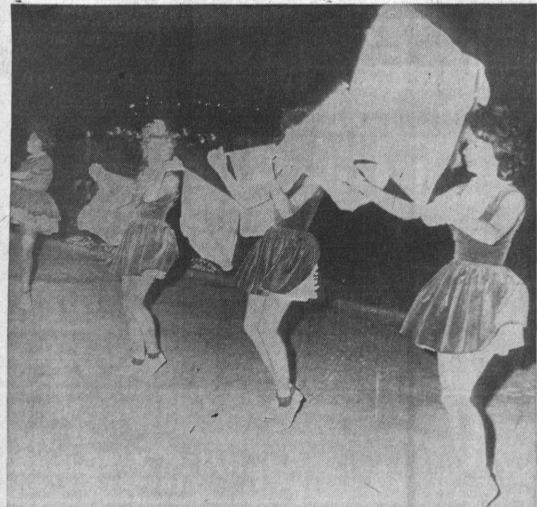
BRAVING WIND and dust, members of of the fans and second, to keep warm. the South High drill team work extra South lost to Mira Costa 13 to 0. hard, first to bolster the sagging spirit

Staff Sports Correspondent pay dirt but two tremendous Brandenburg passed to The loss marked the Spar-tans finished last in the Bay