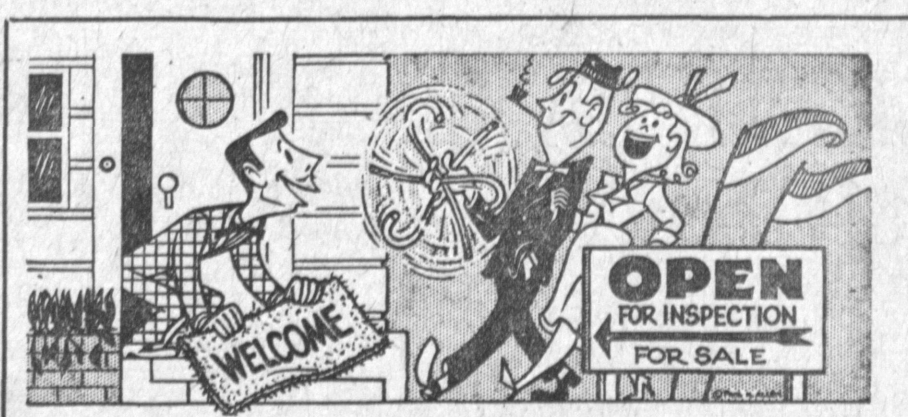
We Welcome Your Visit to Our Open Houses

Your Listing - Your Sale - Your Purchase - Your Escrow - Your entire transactions are handled by capable, courteous, dependable personnel from beginning to end. No better service rendered-anywhere.