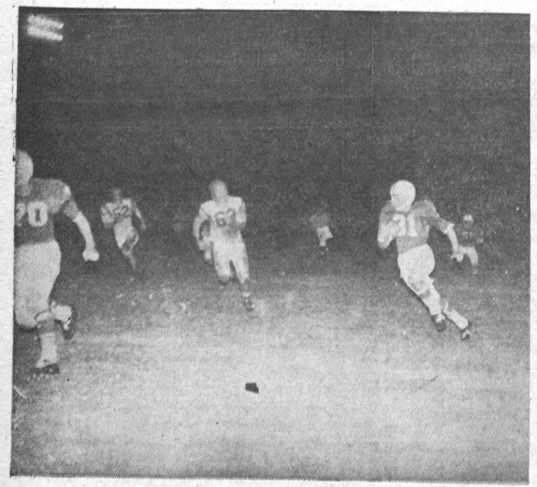
TOUCHDOWN MAKER from Leuzinger helps his high school defeat South High School during Saturday's 19 to 6 disappointment for the local