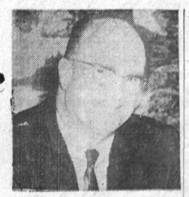
Superintentant of Schools

President "Trough a careful study "We have an opportunity now to get our schools built of information on city planin a real competitive mar-ning, building forecast, zon- "An increase of from thirket, which will save us as ing, and population increas- ty to forty thousand stumuch as a dollar or two per es, it is almost certain that dents is inevitable. Your square foot. It will also the Torrance school populamake it possible for us to tion will increase by at least Board of Education has di-"keep up" instead of having 6000 students in the next ligently accepted the trust to "catch up," which is al-several years. We do not and faith put in it by the