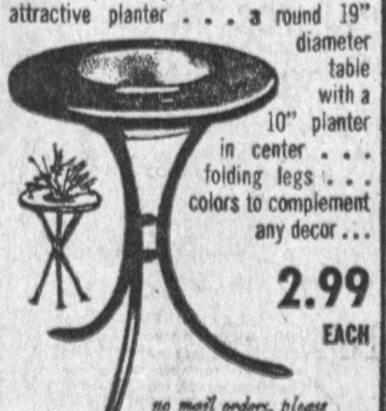
TABLE-PLANTER COMBO Versatile metal tables that do double duty wherever placed . . . as a surface for drinks, ashtrays, etc. . . and as an