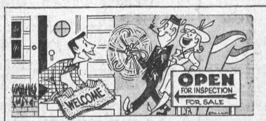
We Welcome Your Visit to Our Open Houses

Your Listing - Your Sale - Your Pur-· Hawthorne-Lawndale Board chase - Your Escrow - Your entire transactions are handled by capable, courteous, dependable personnel from beginning to end. No better service rendered—anywhere.