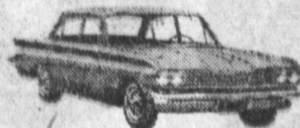
1962 TEMPEST 4-DOOR SEDAN Stock Number 56