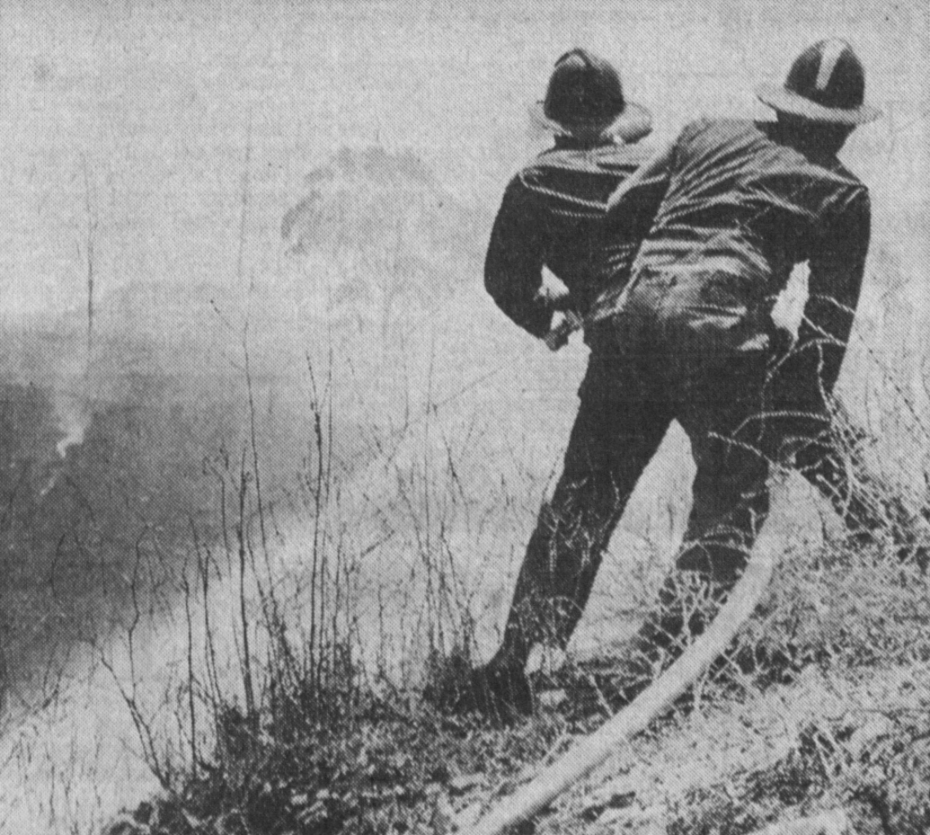
BRUSH BLAZE is controlled Monday near Rolling Hills after coming dangerously close to two expensive homes, burning estimated 20 acres of brush. County firemen under direction of

sibly at the culprit, accord-bottom is safe for walking, professional contesting cow- and attractions plus various boys in the United States game booths sponsored by local service clubs.