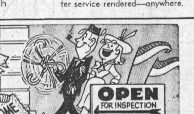
We Welcome Your Visit to Our Open Houses

Your Listing - Your Sale - Your Purchase - Your Escrow - Your entire transactions are handled by capable, courteous, dependable personnel from beginning to end. No better service rendered-anywhere.