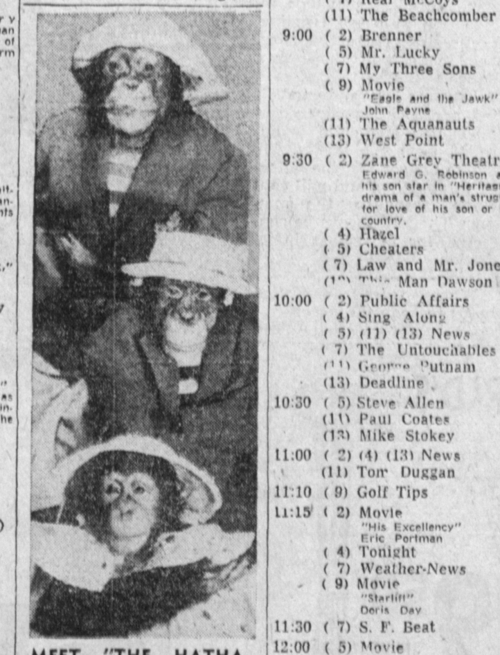
MEET "THE HATHAWAYS"—Reading from top to bottom are Charlie, Enoch and Candy, who debut in "The Hathaways," ABC-TV's new comedy series about a couple trying to raise a trio of chimps as any conscientious parents would. Friday's 8 to 8:30 p.m.