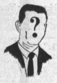
THIS COULD BE YOU