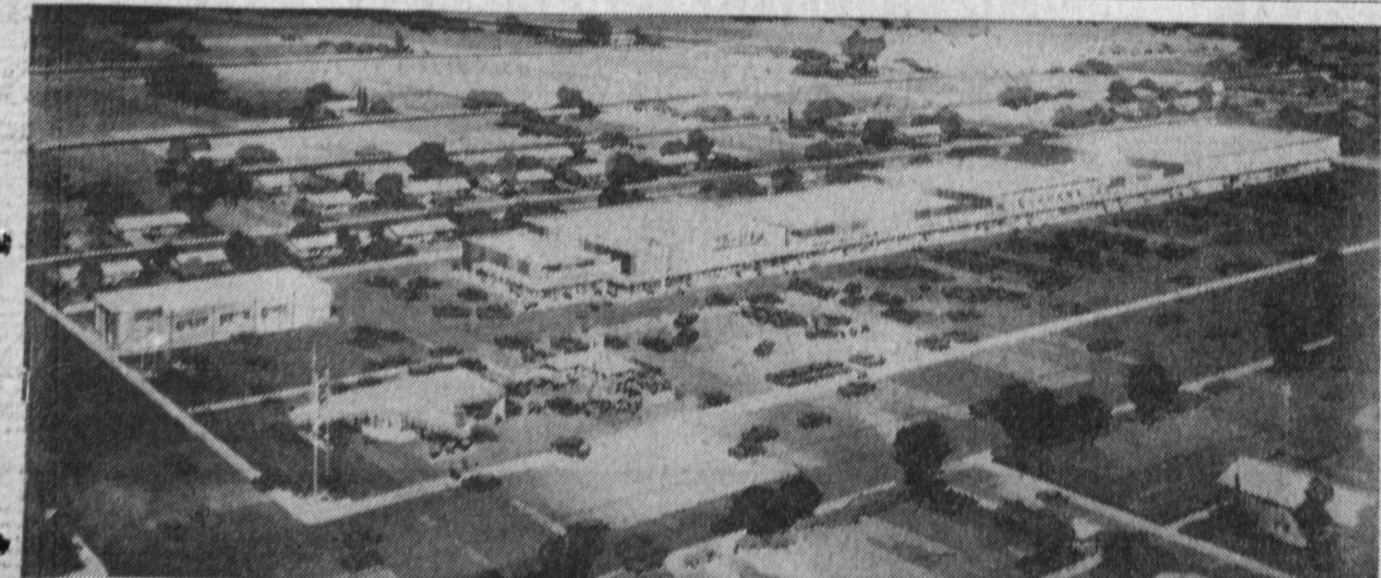
NEW CENTER — This art rendering depicts the $2,000,000 Carson Shopping Center, Carson St., and Normandie Ave., Torrance, upon its completion in September. E. W. Hahn, Inc., is general contractor

"The most important thing in DDD is the area code," the manager said. "For example, to call into Orange County, you would dial '714' prior to the called party's number. To reach 555-2368 in that county, you'd dial 10 digits—714-555-2368—instead of the seven needed for a local call."