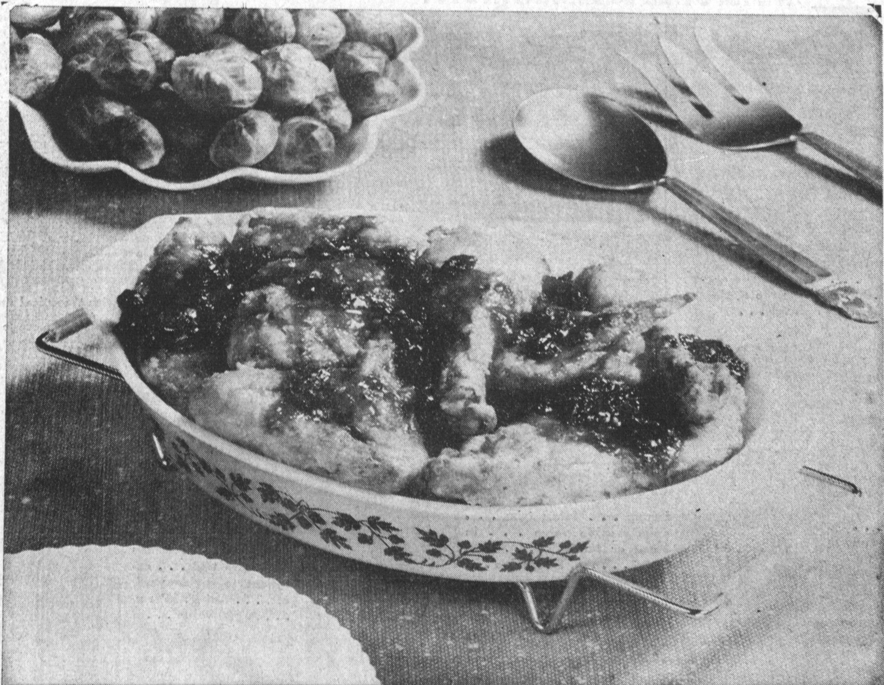
RUBY RED CHICKEN served with Sweet Potato Soufflé, Brussel Sprouts, Hard Rolls, Relish Tray and Rhubarb Pie. (See recipe on this page.)

Drain beans; combine with French dressing and marinate 1 hour. Add chicken, sliced radishes, mayonnaise and lemon juice; toss lightly. Serve in crisp lettuce cups and garnish with whole radishes. Makes about 4 servings.