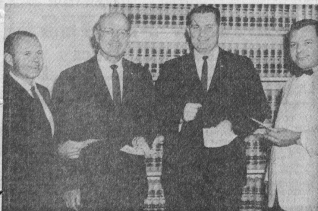
THE CHALLENGERS —Members of the Torrance Lions and Torrance Rotary Club will meet in mortal combat June 16 in a benefit donkey baseball game. All funds derived from the sale of tickets will be donated to the local YMCA building fund. Game will be