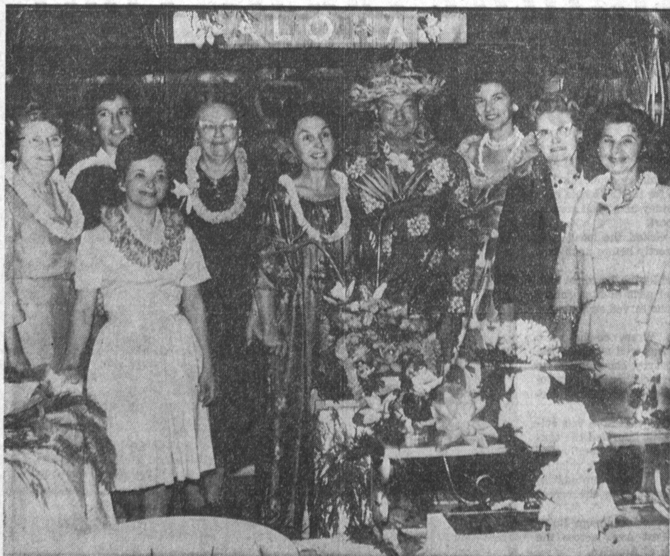
READY FOR LUAU — Members of the Women's Division of the Torrance-Lomita Board of Realtors this week finalized plans for their all-member luau which will be held in the board hall, corner of Sepulveda and Arlington, Saturday evening. Shown as they prepared