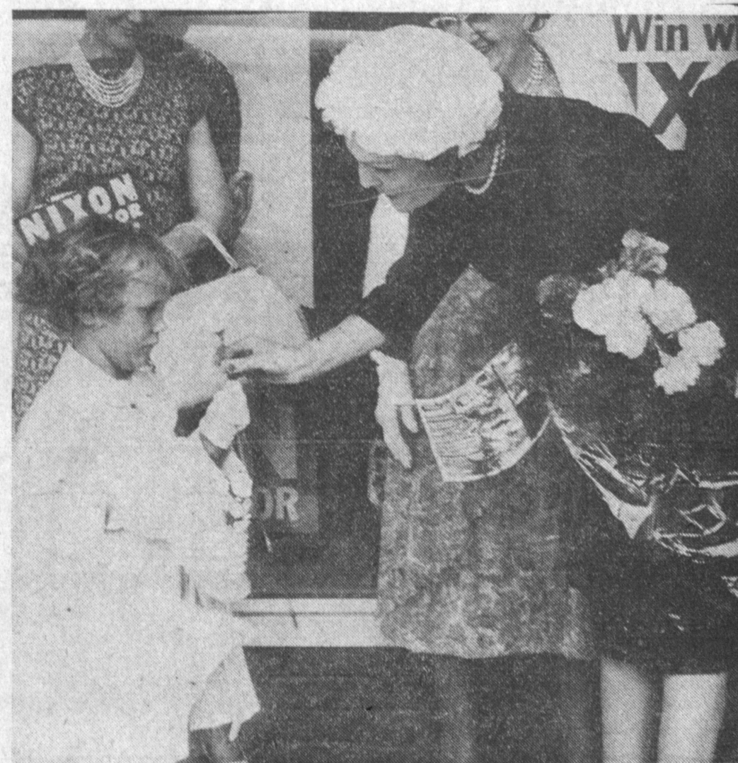
SCENE STEALER — It was Candidate Nixon's wife, Pat, however, who attracted the most attention on the Torrance tour. Bearing a huge bouquet of multi-colored carnations, she chatted with constituents, smiled prettily

Nixon signed autographs, shook hands with well-wishers and greeted many old friends and supporters from this city.