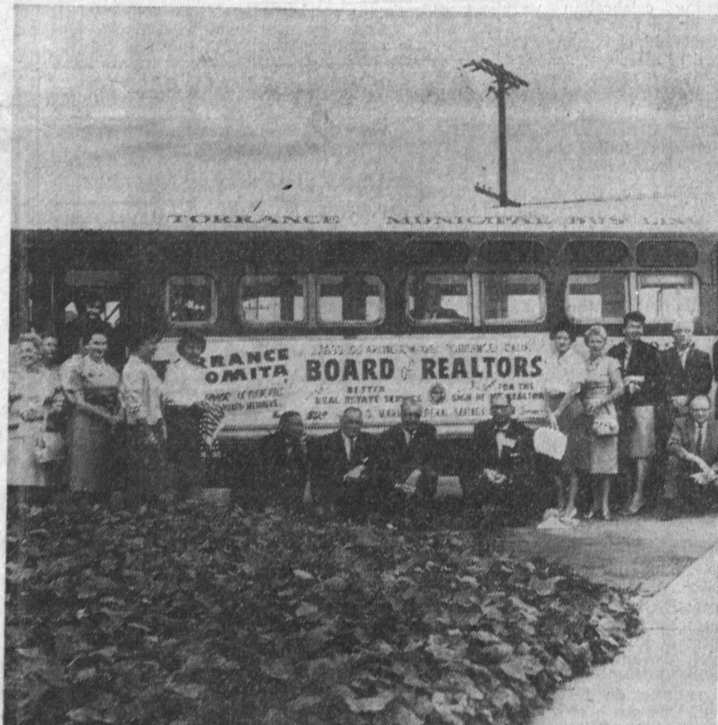
WEEKLY CARAVAN — Members of the Torrance-Lomita Board of Realtors this week launched a program promoting growth of Torrance. A weekly caravan, in which local realtors board a charter bus and tour the

city, the project is becoming extremely popular and is signed up for the next several weeks. Signs promoting Torrance and the local board decorate sides of the bus.