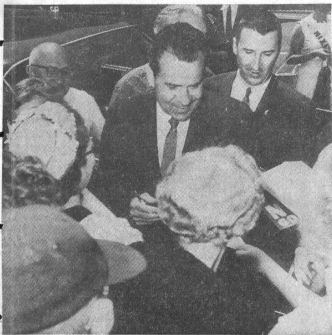
WELCOMING CROWD — Republican gubernatorial candidate Richard M. Nixon was greeted warmly by a horde of well-wishers Monday morning when he made a personal appearance at the local Nixon for Governor

headquarters. The candidate signed autograph books, shook hands and commented briefly on plans for campaign against Democratic opponent Edmund G. Brown.