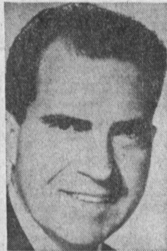
RICHARD M. NIXON ... Challenger