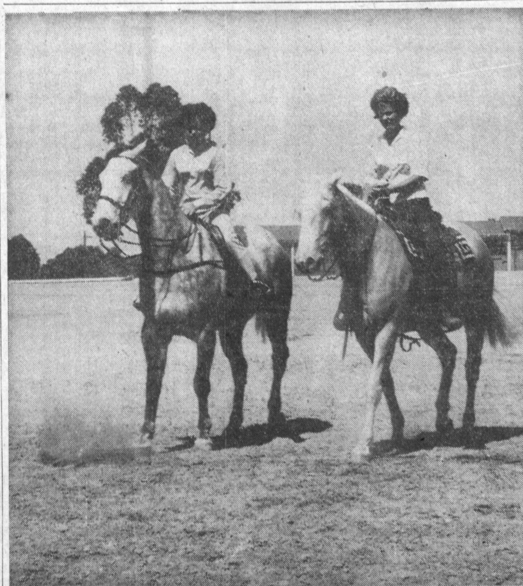
PRACTICE SESSION — Shown practicing for the American Saddlers' Tenth Open Horse Show and Drill Competition, to be held Sunday, June 3, at the Empty Saddle Club, are

Results were: Tigers, 4-Senators, 0; Braves, 5-Dodgers, 0; Pirates, 11-Angels, 0.