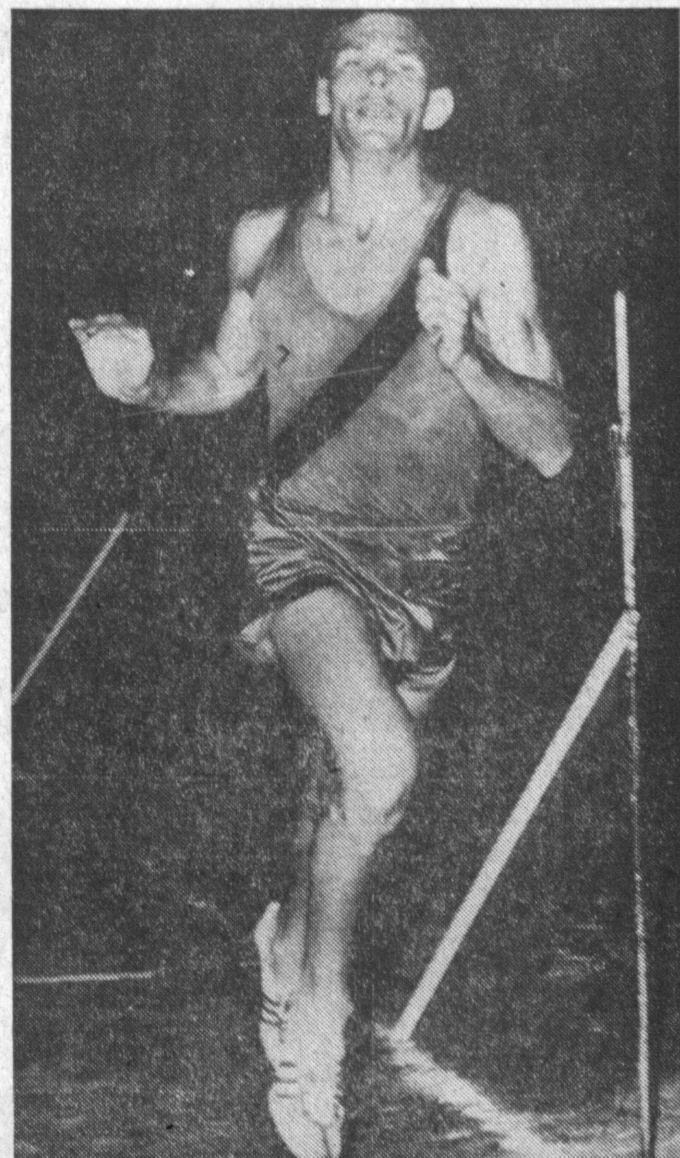
GREATEST MILER — That's Peter Snell of New Zealand, who competes in the "Miracle Mile" of the Coliseum Relays Friday night. Snell holds the world record of 3:54.4. "Anyone who beats Peter will have to better this record," says his coach, Arthur Lydiard.