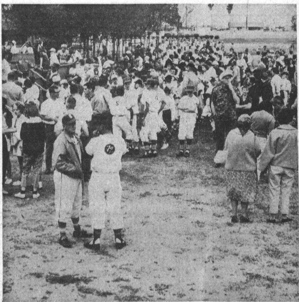
MASS OF LEAGUERS —Huge crowd of uniformed Little Leaguers, representing each of Torrance's leagues, massed behind city hall after the opening day parade held recently. Most of the city's leagues have started preliminary

The speedway is located at 139th St. and So. Western Avenue, just off the Harbor Freeway at the Rosecrans, West, off ramp, then one mile west to Western Avenue, then north to the track.