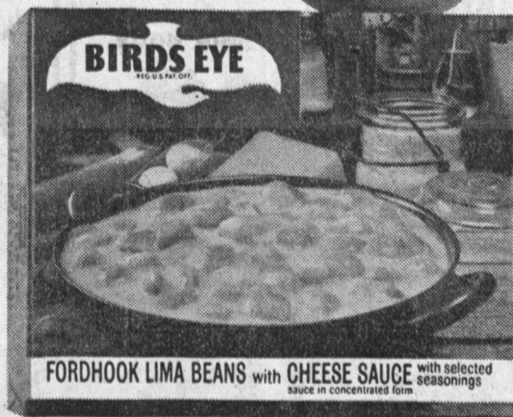
FORDHOOK LIMA BEANS with CHEESE SAUCE with selected seasonings