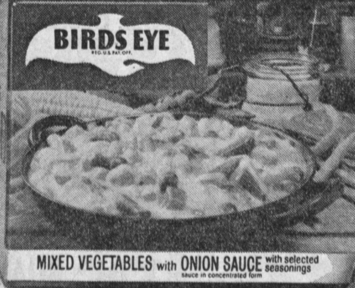
MIXED VEGETABLES with ONION SAUCE with selected seasonings