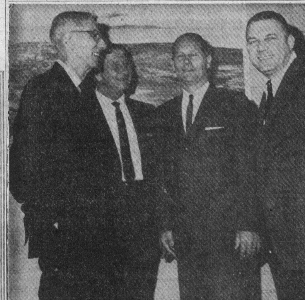
DISTINGUISHED VISITOR — California's Lieutenant Governor Glen Anderson Monday toured Torrence and made an unscheduled stop at the offices of the Torrence Press. Shown