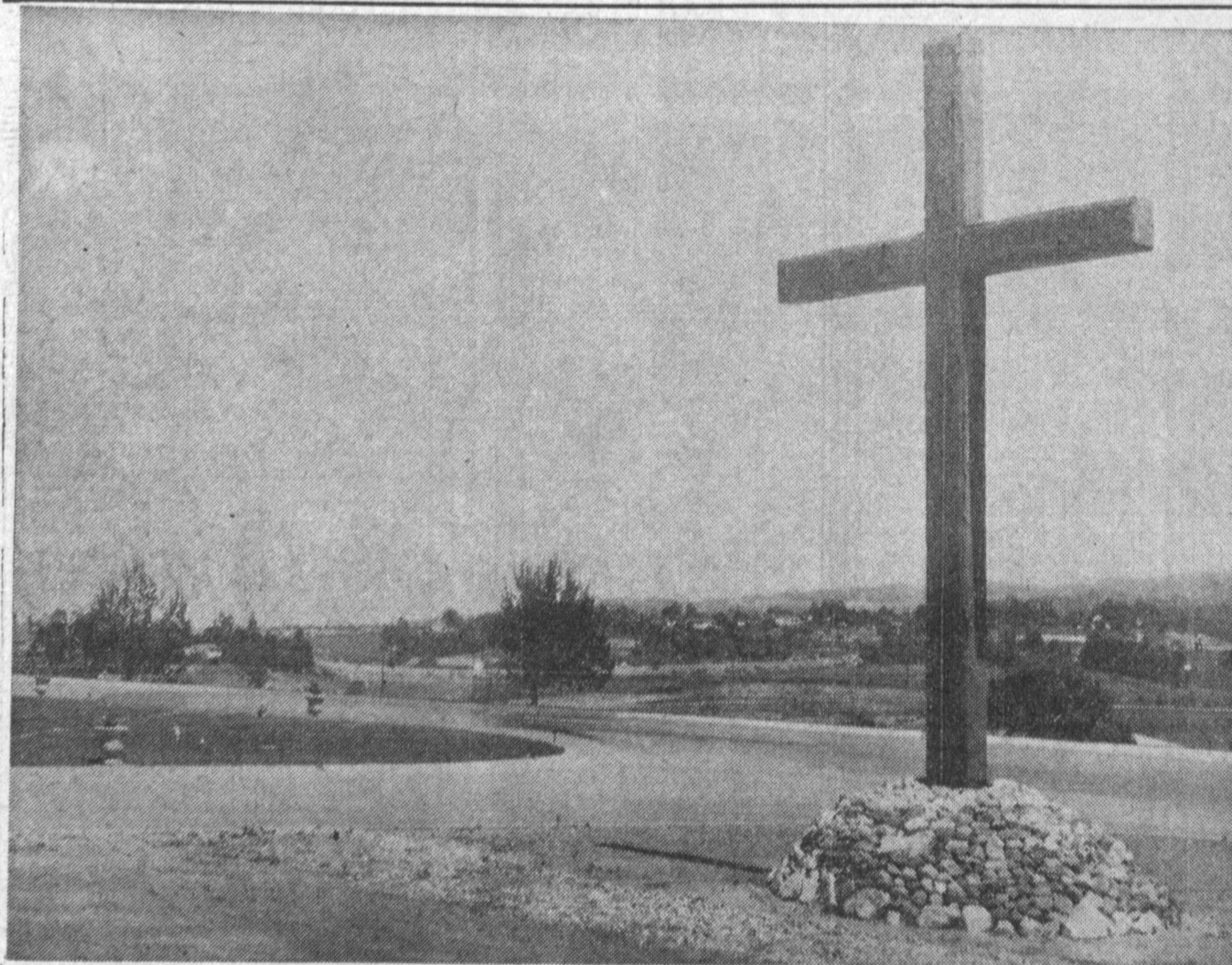
"THE DAY OF RESURRECTION"

The Day of Resurrection! Earth tell it out abroad; The Passover of gladness, The Passover of GOD. From death to life eternal, From this world to the sky, Our Christ hath brought us over With hymns of victory.