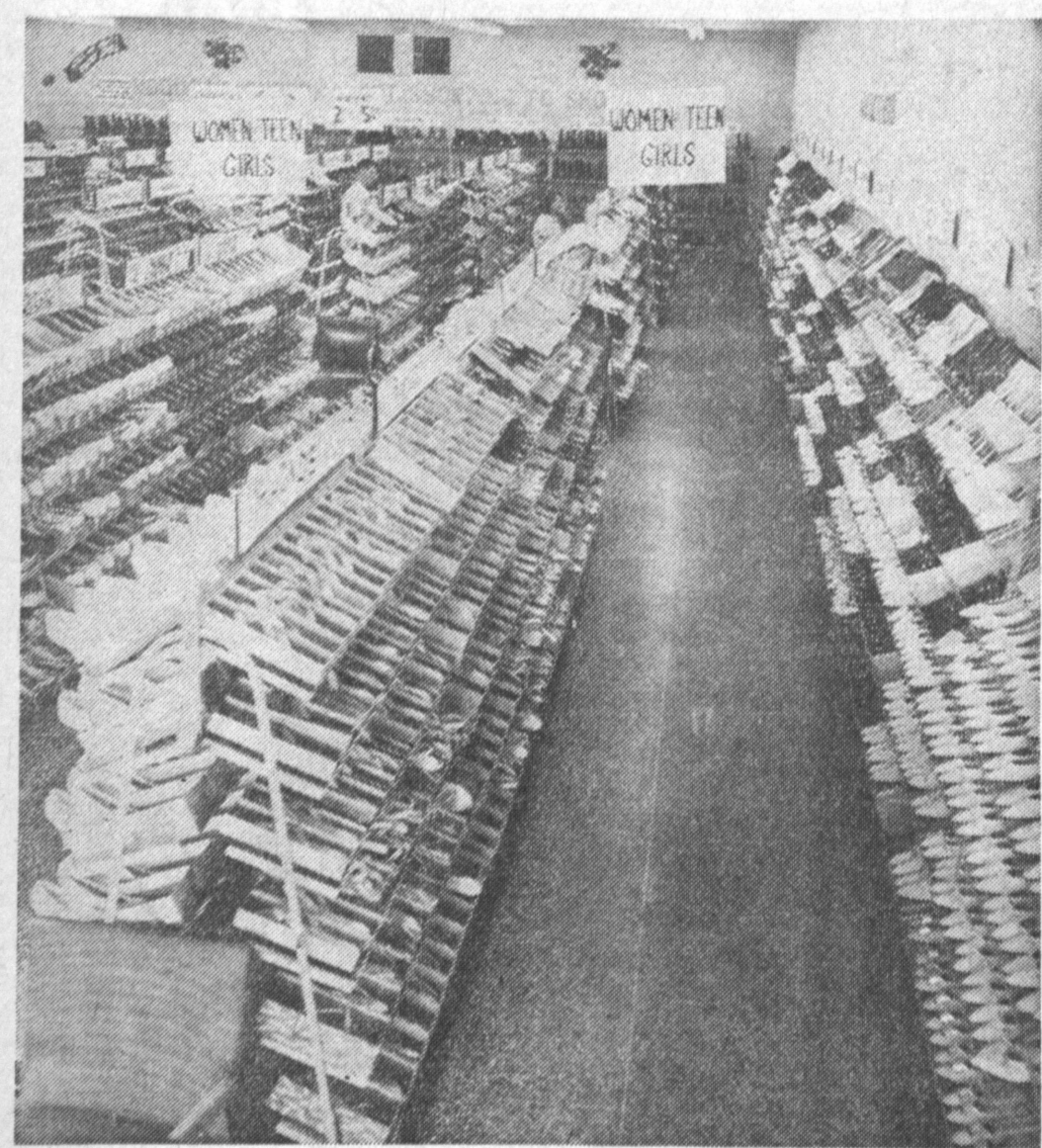
SOMETHING NEW - Super market shopiping methods have been applied to family shoe buying at the unique Shoe Market, located in the Carson-Main Shopping Center. New spring styles for men, women and children

are neatly shelved by group with sizes marked for easy self-service selection. Experienced assistance in the fitting of children's shoes is available when