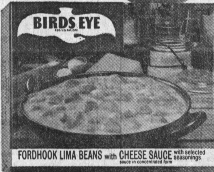
FORDHOOK LIMA BEANS with CHEESE SAUCE with selected seasonings