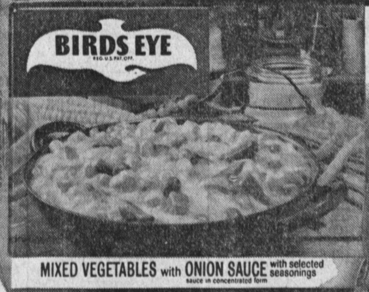
MIXED VEGETABLES with ONION SAUCE with selected seasonings