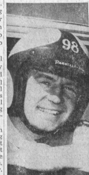
PARNELLI JONES Resumes Feud

Use Press classified ads to buy, rent or sell. Phone DA 5-1517