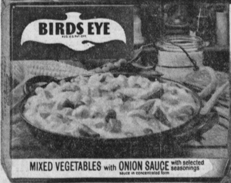
MIXED VEGETABLES with ONION SAUCE with selected seasonings