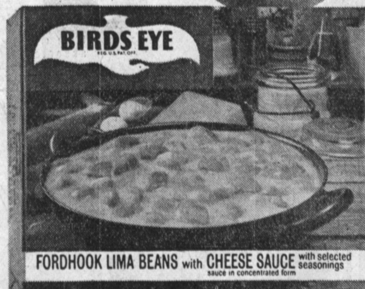
FORDHOOK LIMA BEANS with CHEESE SAUCE with selected seasonings