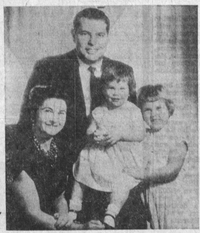
THE LYMANS WORKING TOGETHER FOR A BETTER TORRANCE