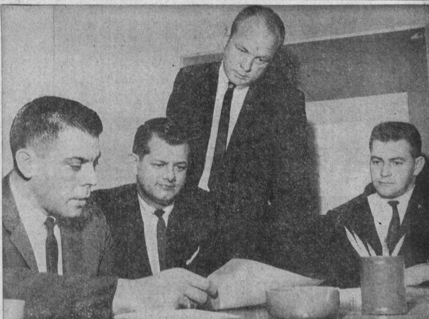
MEET THE CANDIDATE — Members of the Torrance Junior Chamber will sponsor a meeting April 6 at Torrance High School and have invited all candidates for municipal office to be on hand. Candidates will express their views and will answer written question from the