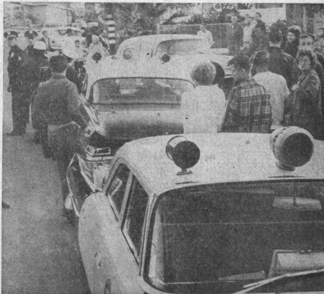
RESIDENTS ASSIST — Two Car thieves, pursued by Torrance police, LAPD squad cars and Sheriff's deputies, crashed their vehicle into a fence in Lomita Friday. Nearby residents helped officers capture one of the sus-