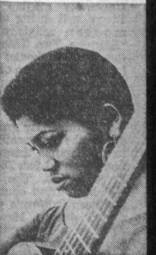
Odetta ... In Concert

She has since confined her realm to the folk art because she finds in it musical freedom and lyrics that express her own sympathies and yearnings. Her repertoire spans virile work songs, hand-clapping chants, spirituals and lullabies. She has had outstanding en-