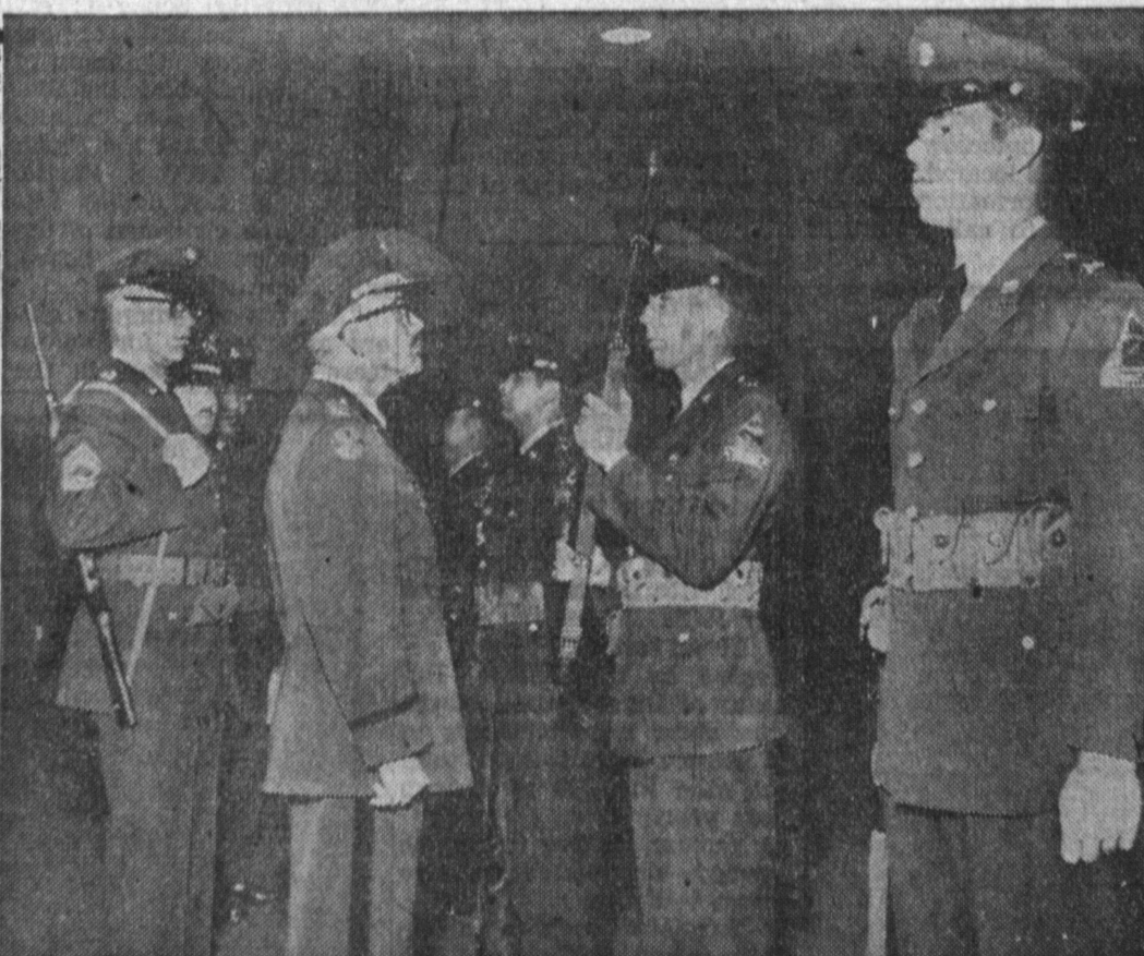
GENERAL INSPECTION —Col. Raymond Guehring, assistant inspector general, Friday night conducted a full-scale inspection of the Torrance National Guard unit at the local armory. Col. Guehring reviewed all three platoons of the local company before inspecting the unit's motor pool and training methods.