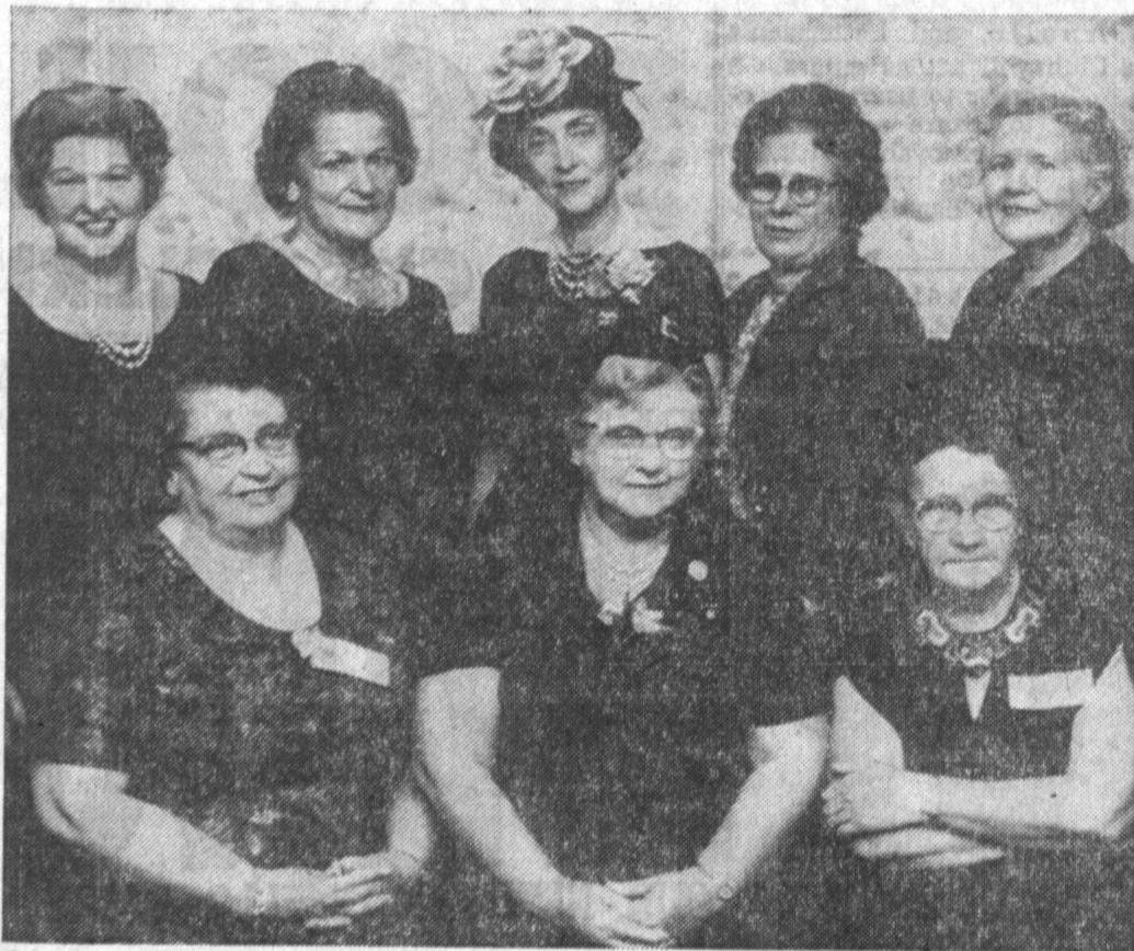
GATEWAY PTA PAST PRESIDENTS ... From 1940 - 1960