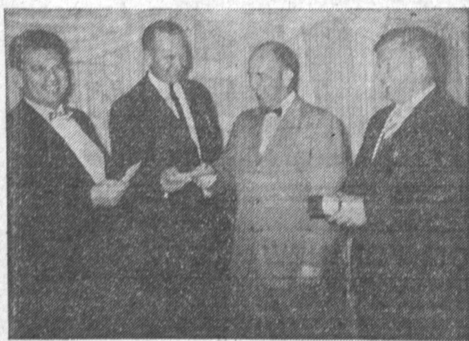
MORNINGSIDE CHAPTER NO. 601 ... Sponsors Project