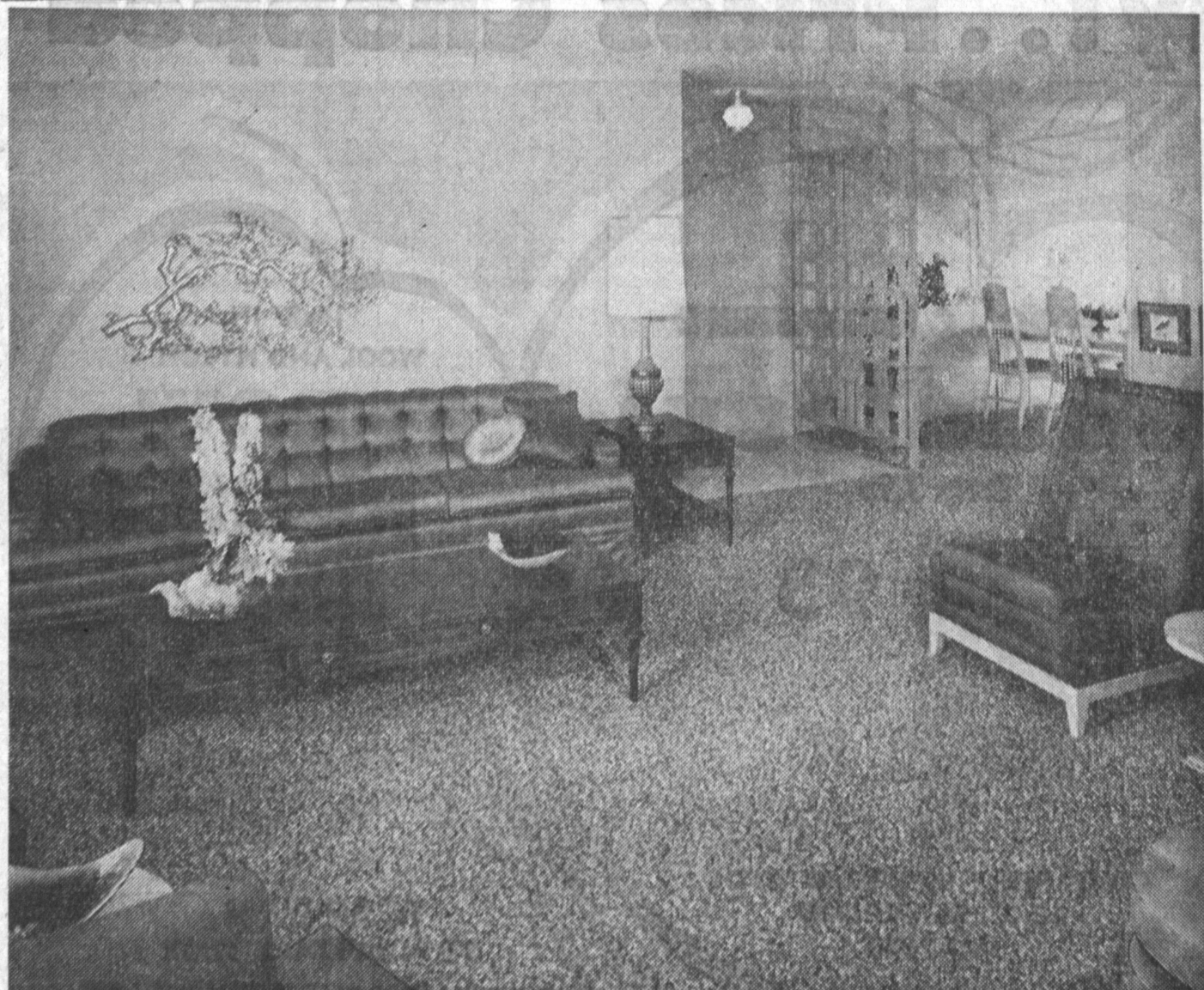
MODERN BEAUTY — Spaciousness and livability are key features offered in Del Amo-Pacific units, which will bear Gold Medallion Awards, signifying that they meet highest standards for electrical excellence of