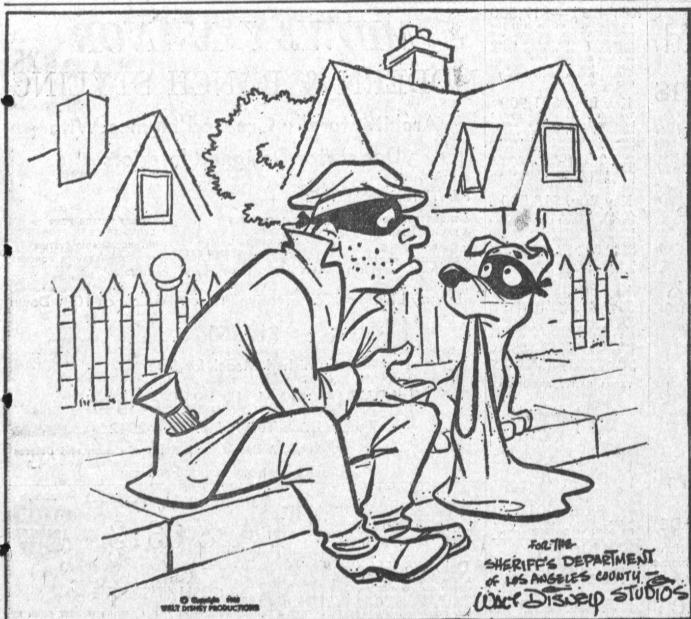
"This 'Keep A Light in Your Home At Night' Gimmick is too nerve-wracking... Let's move."